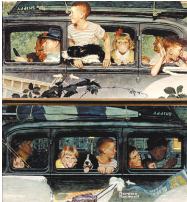
Figure 13 Norman Rockwell, 1948: "The Outing"

At the same time, a relevant part of the value of such a shared asset seems to result from the prevalence of relational or pro-social motivations for acting. The personal pathways of change are likely to affect the dynamic of AFNs and of the shared, relational assets they rely on. In figure 14, some examples are provided of alternative strategies (substitution, stratification, and displacement) that can be followed in changing personal behavior to join AFNs both as producers and consumers.