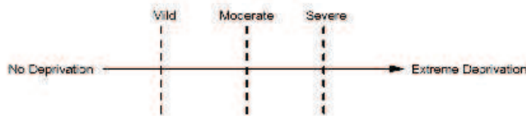
Figure 2: Continuum of deprivation.

This was developed to provide a first conceptualization of multidimensional child poverty (negative aspects of children’s situations) in developing countries, making international comparisons possible (figure 2).